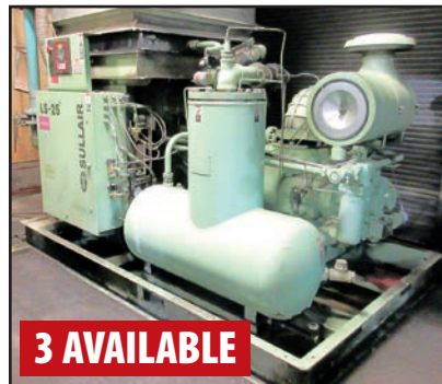
SULLAIR LS-25 200 HP AIR COMPRESSOR