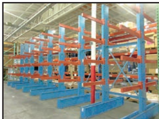
VIEW OF CANTILEVER RACKING