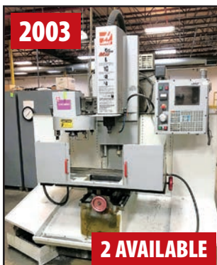
2003 2 AVAILABLE HAAS TM-1 VERTICAL MACHINING CENTER