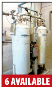
ULTRA-AIR REGENERATIVE AIR DRYERS