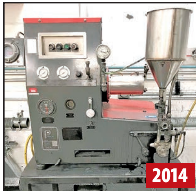
PREMIER MILL M+HML-0.75 5 HP MEDIA MILL