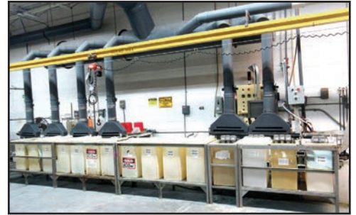
R&D NICKEL PLATING LINE