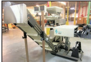
ADVANCED AUTO BAGGING/PRINTING/PACKAGING SYSTEM

(2) 2016 MIYACHI UNITEK LW50A LASER WELDERS , w/Tek Temp Chiller