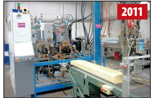
CUSTOM DENSE FOAM EXTRUSION SYSTEM