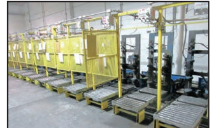
CUSTOM 15 DRUM TUMBLER/MIXER