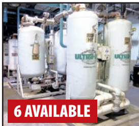
ULTRA-AIR REGENERATIVE AIR DRYERS