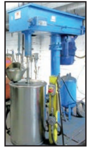
HAYSSEN BARREL MIXER