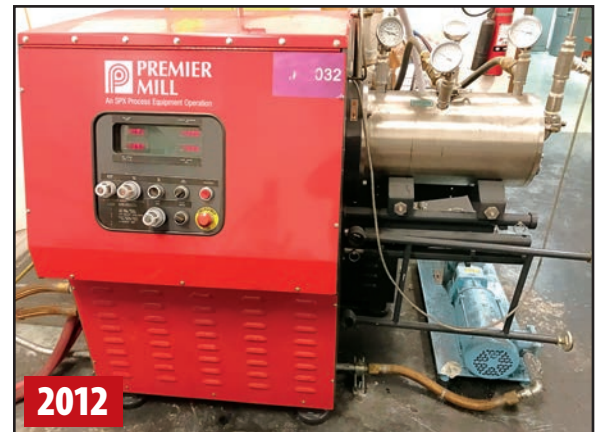
PREMIER MILL SM-15 25 HP MEDIA MILL

Sale Closing From: Thursday, March 7 at 10:00 AM ET Location: 3010 Lee Avenue, Sanford, North Carolina 27332 Inspection: Monday, March 4 from 8:00 AM to 4:00 PM ET