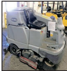
ADVANCE CONDOR ELECTRIC POWER SCRUBBER

ALSO: (200) ASSORTED TEAR DROP PALLET RACKS, CANTILEVER RACKING, DIE RACKS, STRETCH WRAPPERS, DIGITAL PLATFORM SCALES, DUMPING SCRAP HOPPERS, WORK BENCHES, TOOL CARTS, FLAMMABLE LIQUID STORAGE CABINETS, ROLLING SHOP LADDERS, RIGGING EQUIPMENT AND HARDWARE, RETRACTABLE HOSE REELS, RETRACTABLE ELECTRICAL REELS, LADDERS, ELECTRICAL/PLUMBING/MAINTENANCE HARDWARE, ELECTRIC HOISTS AND MORE