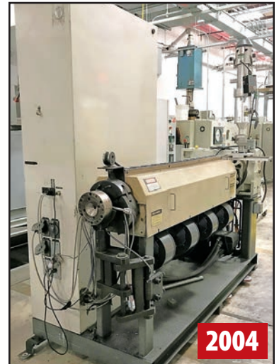
CINCINNATI MILACRON 2.5" 30:1 EXTRUDER LINE