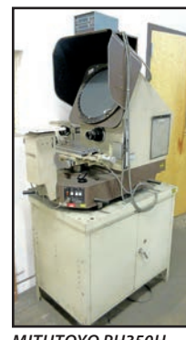
MITUTOYO PH350H OPTICAL COMPARATOR