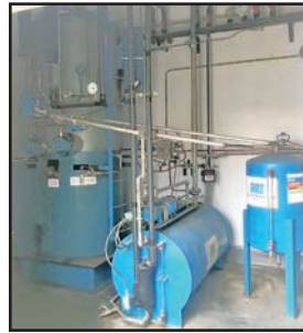
PRI ACETONE DISTILLING SYSTEM