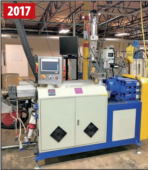
CGM 2" 30:1 HIGH PRECISION EXTRUDER LINE