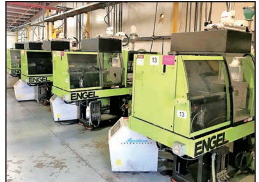
ENGEL 30- AND 28-TON INJECTION MOLDERS