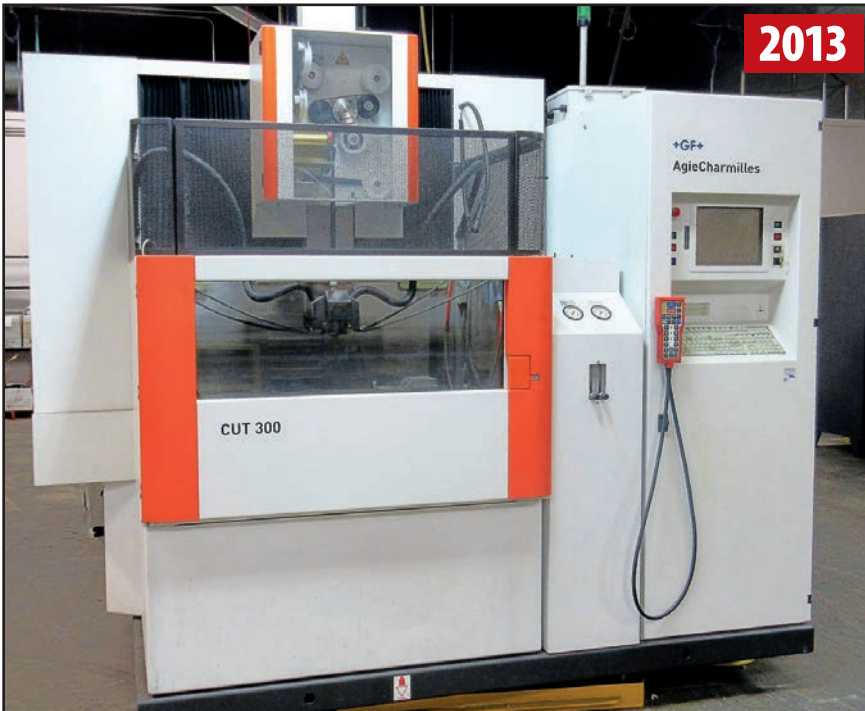
AGIE CHARMILLES CUT 300 CNC WIRE EDM