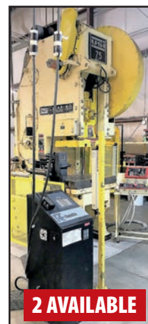
USI CLEARING 75-TON OBI PRESSES