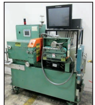
2" X 16" CATERPULLER/ CUT-OFF

View our current auction schedule at www.perfectionindustrial.com