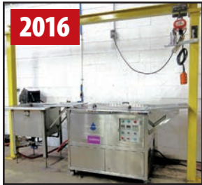
2016 PRO ULTRASONIC WASH SYSTEM

ENERCON ATMOSPHERIC PLASMA 3D SURFACE TREATERS