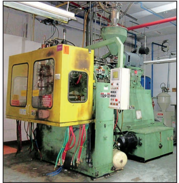
BEKUM H121-S831 SINGLE EXTRUSION DOUBLE DIE BLOW MOLDER