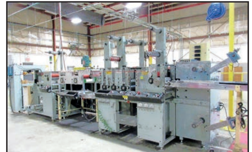
ALLIED GEAR NO 10 PRINTING PRESS