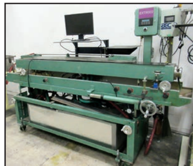
RON COOLING TROUGH