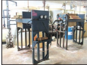
WASTE WATER TREATMENT PLANT