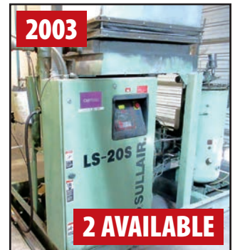
SULLAIR LS-20S 125 HP AIR COMPRESSOR