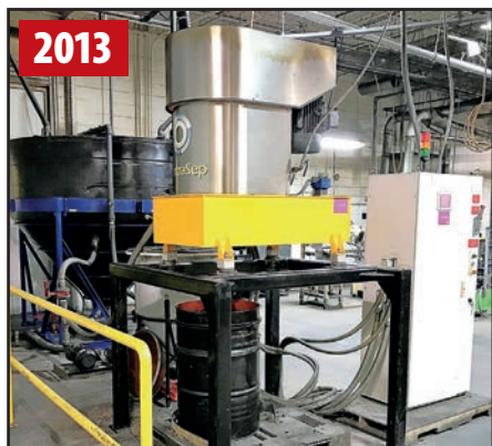
2013 CENTRA SEP 10 HP CHIP RINGER/COOLANT FILTER RECOVERY UNIT