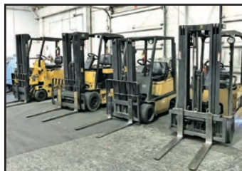
VIEW OF FORKLIFTS