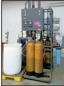
DI WATER SYSTEM