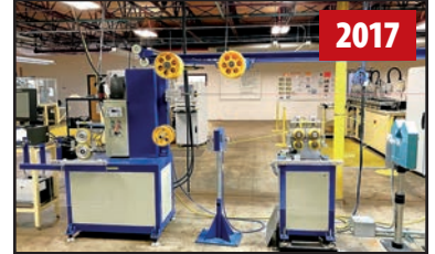
CGM TENSION CONTROL AND ACCUMULATOR