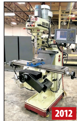
2012 ACER FVS-3VKH-54 3 HP CNC MILL

ALSO: (3) DONALDSON TORIT MEDIA 2 DUST COLLECTORS, s/n 3335758, 3030090, NA, AERCOLOGY MDV3000 DUST COLLECTOR, s/n 637554, (3) EMPIRE TT-36-S AUTOMATED SANDBLAST CABINETS, s/n E95018, E95017, NA w/Dust Collectors, PROCENTER PLUS CTR200/1 SANDBLAST CABINET, s/n PC715, (7) SMOG HOG MIST FILTERS