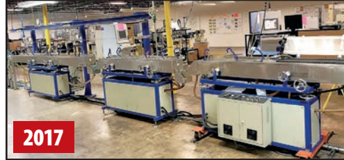
CGM SS VACUUM COOLING TROUGH

Sale Date: Tuesday, March 5 at 9:00 AM ET Location: 3010 Lee Ave., Sanford, North Carolina 27332 Inspection: Monday, March 4 from 8:00 AM to 4:00 PM ET