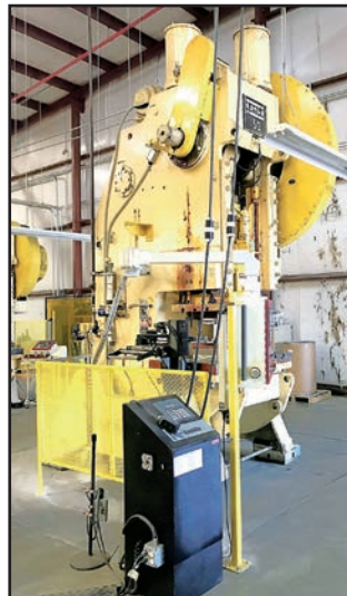
USI CLEARING 150-TON OBI PRESS