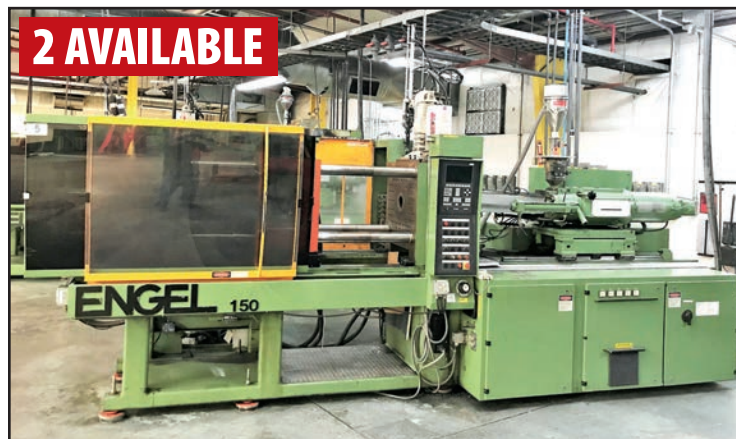
ENGEL 150-TON INJECTION MOLDER

View our current auction schedule at www.perfectionindustrial.com