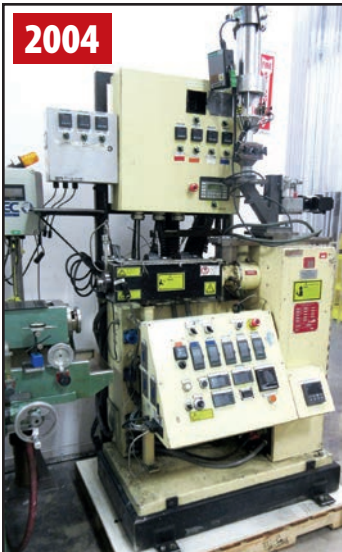
DAVIS STANDARD 1" 24:1 EXTRUDER LINE

Webcast Bidding Available Through BidSpotter.com