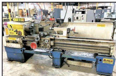
LION 24" X 96" GAP BED ENGINE LATHE