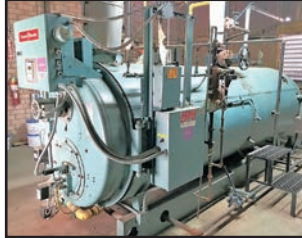
CLEAVER BROOKS CB700-100 BOILER