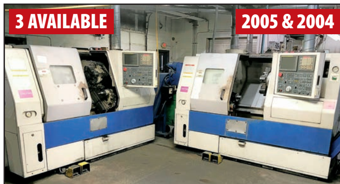
3 AVAILABLE 2005 & 2004 DAEWOO PUMA 240A TURNING CENTERS