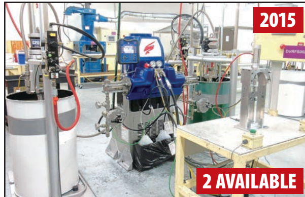
GRACO FIXED RATIO METER, MIX AND DISPENSE SYSTEMS