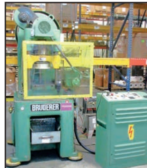
BRUDERER 30-TON 3-POST HI-SPEED PRESS