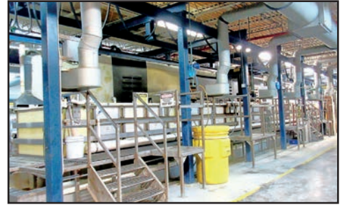
NICKEL AND BLACK OXIDE PLATING LINE