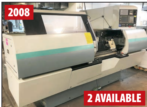
2008 JUNKERS GRINDOR SILVER CNC UNIVERSAL CYLINDRICAL GRINDER