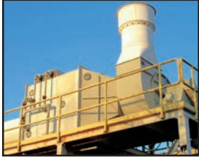
PLATING LINE SCRUBBER SYSTEM

Inspection: Monday, March 4 from 8:00 AM to 4:00 PM ET