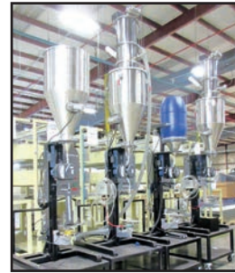
(4) JSCC AUTOMATION TONER AUTO-FILLING UNITS