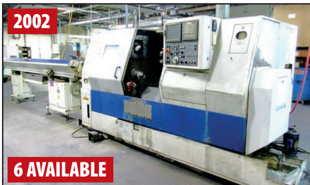
2002 DAEWOO PUMA 230MSA TURNING CENTER

(6) 2002 AND 2000 DAEWOO PUMA 230MSA TURNING CENTERS, s/n 23MS2544, 23MS2541, 23MS0220, 23MS0217, 23MS0153, 23MS0123, w/Fanuc 18i-T Control, (2) w/Lemca Boss 542 CNC/37 Bar Feed (sold separately)