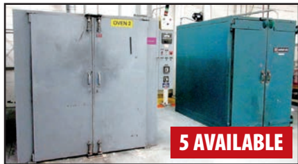
VIEW OF OVENS

ALSO: 2016 PRO ULTRASONIC PRO3624 ULTRA SONIC WASH SYSTEM, s/n 362400391, W/GANTRY HOIST SYSTEM, PRI ACETONE DISTILLING SYSTEM, FINISH THOMPSON LS-55IID SOLVENT RECYCLING SYSTEM, (4) JSCC AUTOMATION TONER AUTO-FILLING UNITS, (5) TEK TEMP TKD200 CHILLERS, HAYSSEN BARREL MIXER, COWLES DISSOLVER MIXER, CUSTOM 15 DRUM TUMBLER MIXER, (8) BLUE-M STABIL-THERM OVENS, CYCLONE STAINLESS STEEL PARTS BLOWER/FILTER TUNNEL, (42) ASSORTED PNEUMATIC PUMPS, (56) PNEUMATIC MIXERS/AGITATORS, RAM BARREL CRUSHER, PAINT SHAKERS