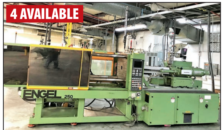
ENGEL 250-TON INJECTION MOLDER

To discuss your requirements for an auction, please call Perfection Industrial +1-847-545-6374