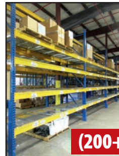
VIEW OF ADJUSTABLE PALLET RACKING