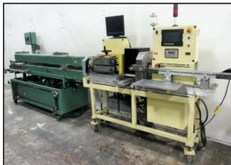
CINCINNATI MILACRON DOWNSTREAM EQUIPMENT