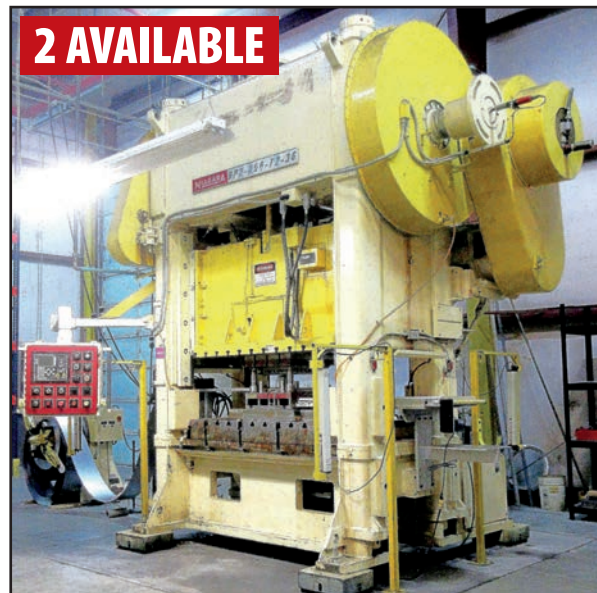
NIAGARA BP2-200-72-36 STRAIGHT SIDE PRESS

V&O 35-TON HI-SPEED OBI PRESS , s/n 35ST-187, w/125-250 SPM, Coil Feed, Pallet Uncoiler