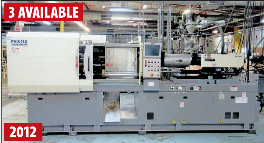
NISSEI 123-TON SERVO ELECTRIC MOLDER

FEATURING: (25) INJECTION MOLDERS, (5) BLOW MOLDERS, (4) EXTRUDERS, STAMPING, EDMS, SWISS TYPE SCREW MACHINES, CNC TURNING, GRINDING & MACHINING, CONVENTIONAL MACHINE TOOLS, INSPECTION, (5) PREMIER MILL HORIZONTAL MEDIA MILLS, INK MIXING/PROCESSING, PLATING, WASTE WATER PLANT, FACTORY SUPPORT, FORKLIFTS, MATERIAL HANDLING & MORE