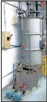
PLATING LINE SCRUBBER SYSTEM