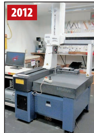
2012 MITUTOYO CRYSTA APEX S574 CMM