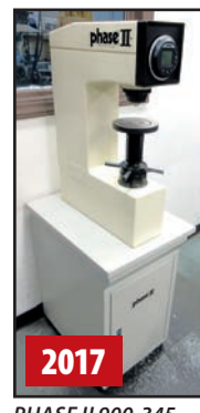
2017 PHASE II 900-345 DIGITAL ROCKWELL HARDNESS TESTER