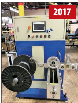
CGM 24" HI-SPEED SPOOLER