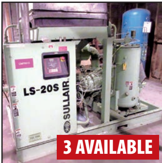
SULLAIR 100 HP AIR COMPRESSOR