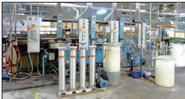
CUSTOM PARTS WASH LINE