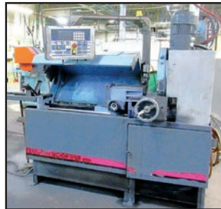
TIGER SAW 350FE CNC AUTO COLD SAW