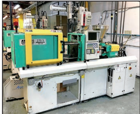
ARBURG 15-TON INJECTION MOLDERS